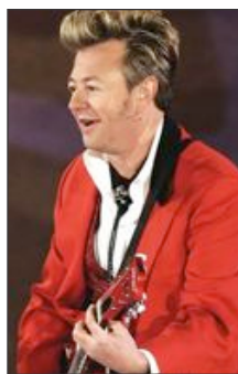
■ Brian Setzer

Carl Palmer's ELP Legacy , Nov. 18, 8 p.m., Tangier, Akron, $25 to $40 at 330-376-7171.