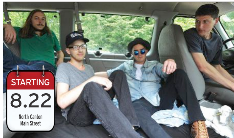
REPOSITORY JULIE VENNITTI