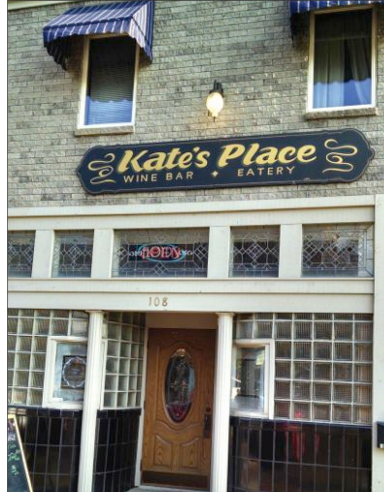
■ Kate's Place is located at 108 E. Main St. in downtown Louisville.

Reach Dan at 330-580-8306 or dan.kane@cantonrep.com. On Twitter: @dkaneREP