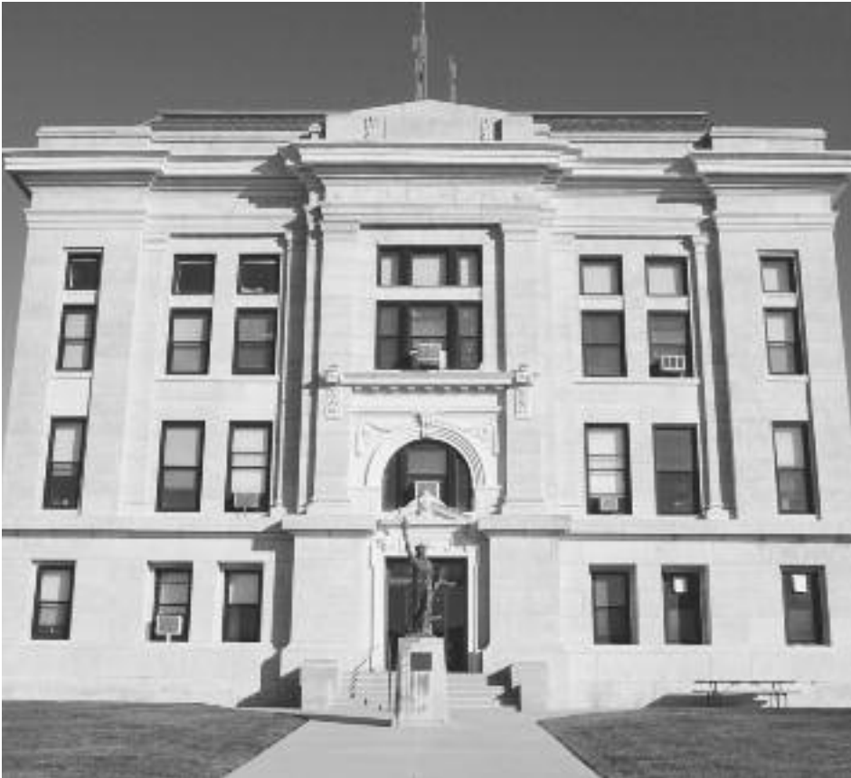
Cooper County Courthouse.

Sophisticated legal systems are not limited to the big cities. Cooper County has a number of firms with established legal counselors that are ready to help if you find yourself in need of legal advice. From criminal attorneys to estate planning, Cooper County has a service that will fit your needs.