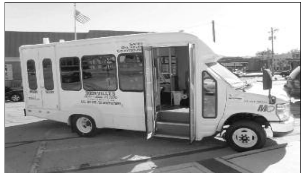
The Katy Flyer operates within the city limits of Boonville.