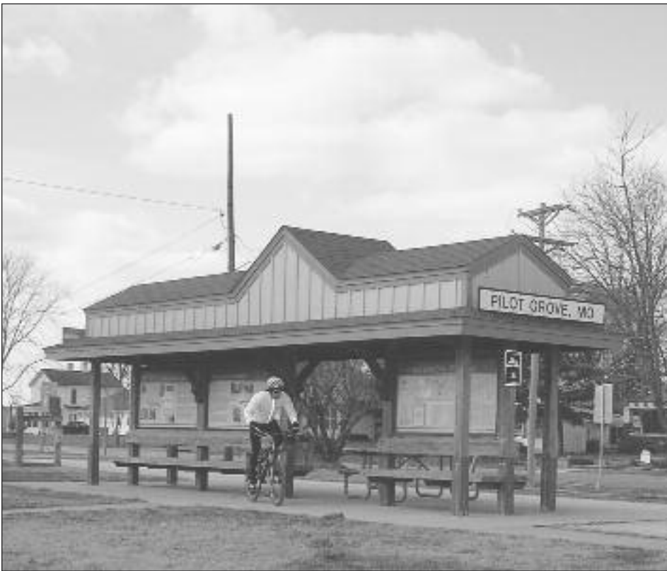
Pilot Grove Trailhead.